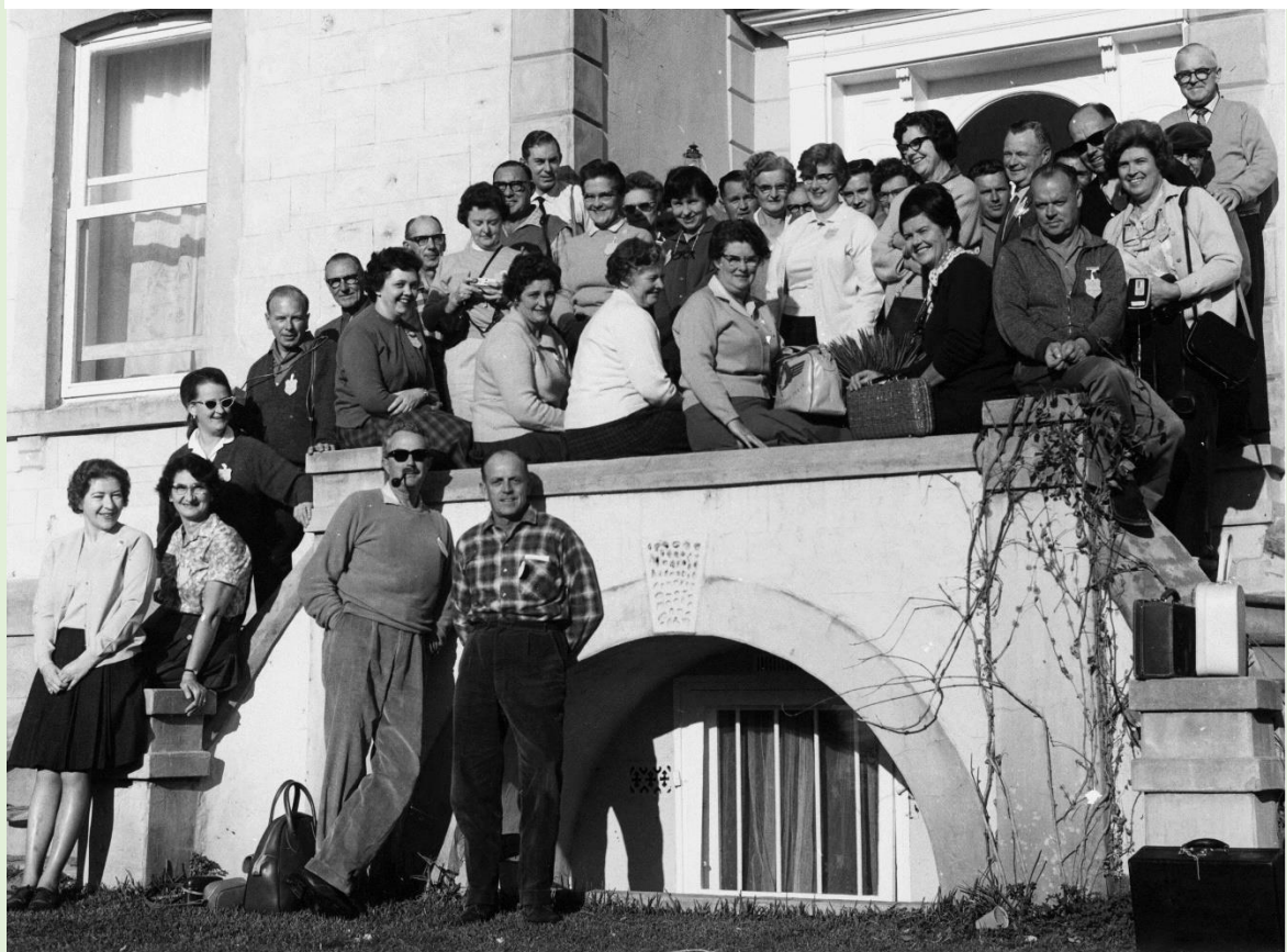
1973 S.A.P.F. Seminar, Graham's Castle, Goolwa.