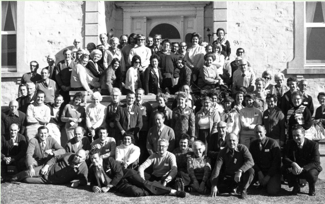
1970 S.A.P.F Seminar, Graham's Castle, Goolwa.