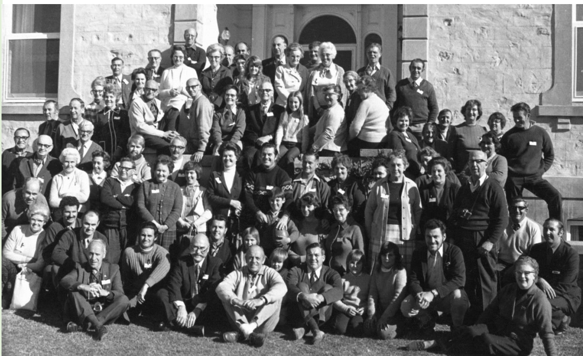
1971 S.A.P.F. Seminar, Graham's Castle, Goolwa.