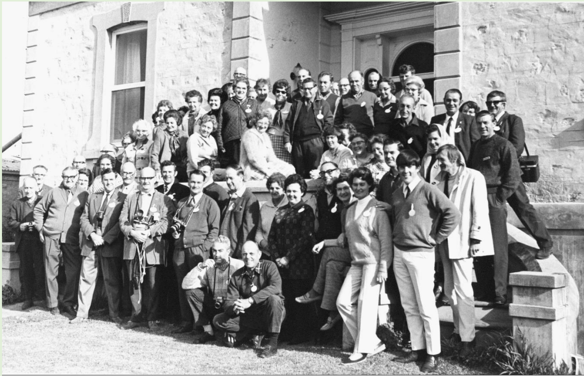
1972 S.A.P.F. Seminar, Graham's Castle, Goolwa.