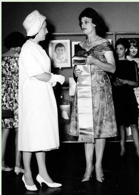
1963 Dame Ruby Litchfield with sash at Amateur Photography - woman unknown

The total raised was £438/2/6 ($876.25) from 16 clubs. This was an outstanding amount in those days. All of this coincided with the Annual Exhibition, which meant that the South Australian Photographic Federation . Council and club committees had an extremely busy, but highly successful time.